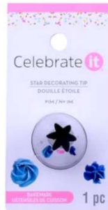
Wilton Star 1M or 2D