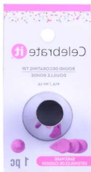
Wilton Open Round 1A