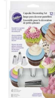
Wilton Cupcake Decorating Icing Tips, 12-Piece Set